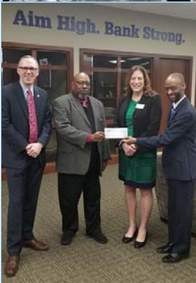
Thank you, CBI Bank and Trust for your generous donation.